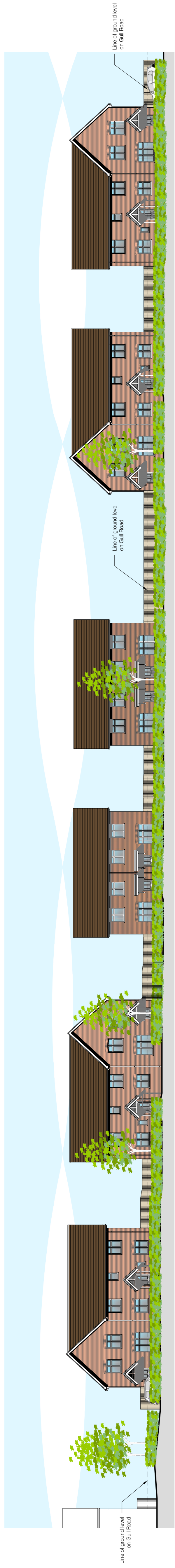
STREET ELEVATION (AT SITE LEVEL) scale 1:200