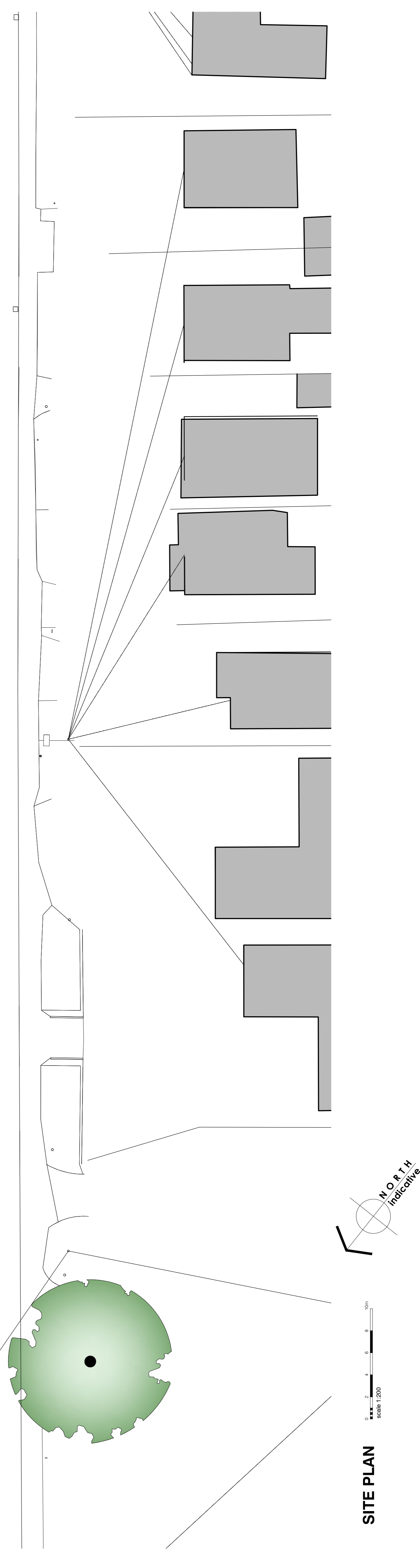
SITE PLAN scale 1:200